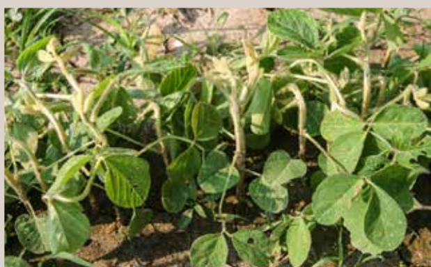
Figure 2. Soybeans that have been injured by off-target movement of 2,4-D. Notice the twisted stems and petioles.