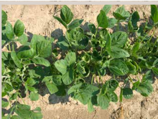
Figure 1. Soybeans that have been damaged by 1/20,000 of a standard use rate of dicamba. Notice the newest trifoliates are distinctly cupped upwards.

Enlist™ and Xtend® traits are engineered to provide resistance to the group 4 synthetic auxin herbicides 2,4-D and dicamba, respectively. These traits allow, for the first time, POST applications for control of broadleaf weeds in soybean and cotton. However, many broadleaf plants are inherently sensitive to 2,4-D and dicamba, and the use of the Enlist and Xtend technologies requires proactive stewardship of the herbicides.